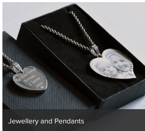
Jewellery and Pendants